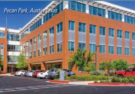
Pecan Park, Austin, Texas