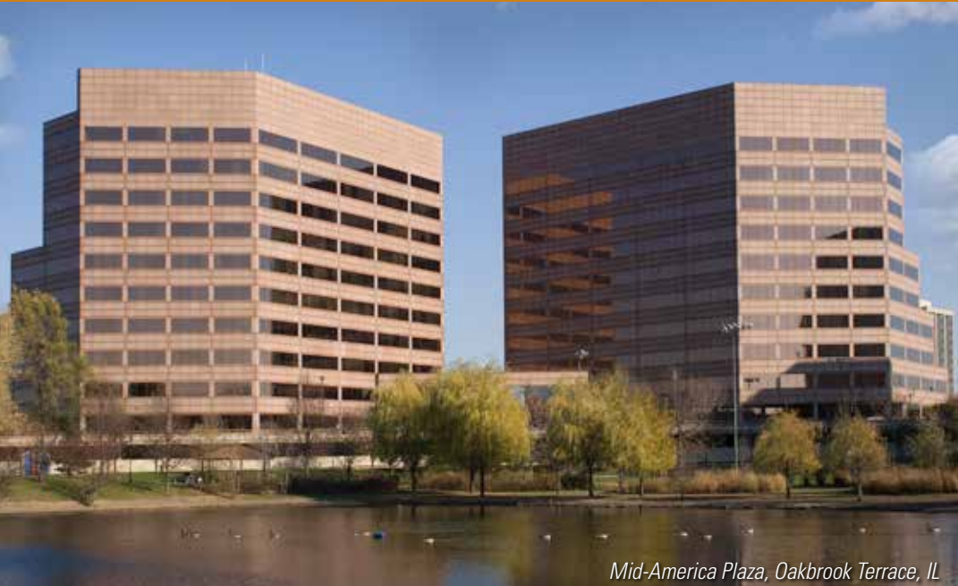
Mid-America Plaza, Oakbrook Terrace, IL