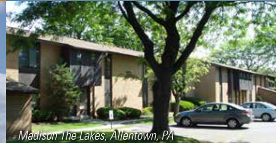
Madison The Lakes, Allentown, PA